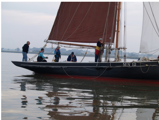
Polly at the Colne Match start last year

We were to take Polly from Pinmill back to Brightlingsea on the Tuesday following the Pinmill Smack Race last year. A little arrow on the TV screen showed a 3mph breeze from the SW running straight down the Wallet, right on the nose, as would be the strongly ebbing tide. How could this possibly work out?