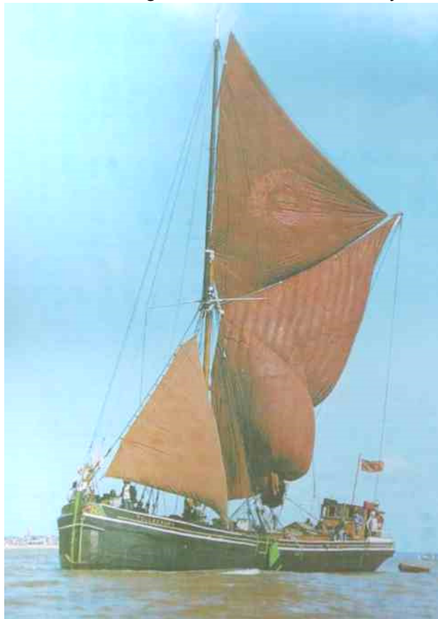
The barge Tollesbury .

back on board, so we went to wait in the wheelhouse to give assistance should they