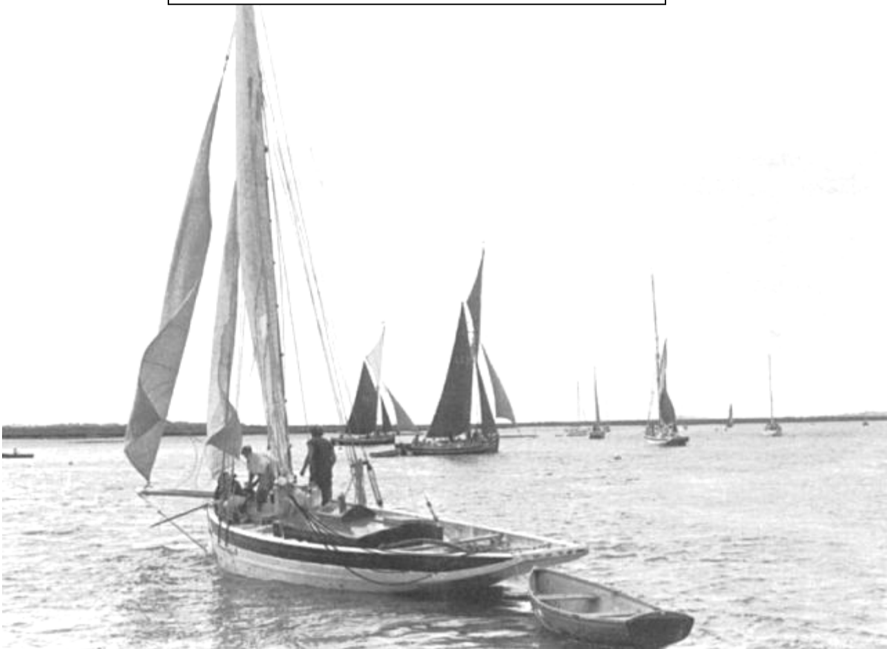
Fly MN17 and other vessels competing in the 1990 Pyefleet smack race.

24 Manor House Way, Brightlingsea, Essex CO7 0QR Ph: 07732 016139 e-mail: wmwill@tiscali.co.uk