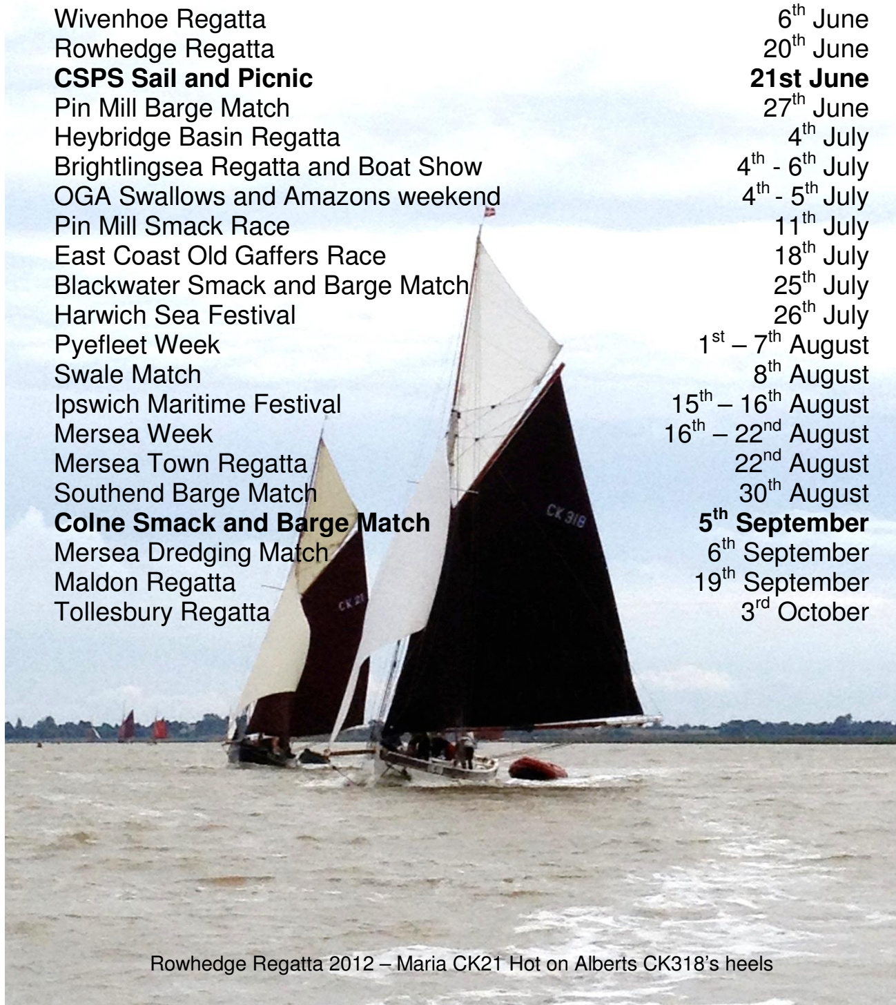
Rowhedge Regatta 2012 – Maria CK21 Hot on Alberts CK318's heels

Details listed are believed to be correct at the time of going to press. Please notify the Editor with any changes or corrections as soon as possible.